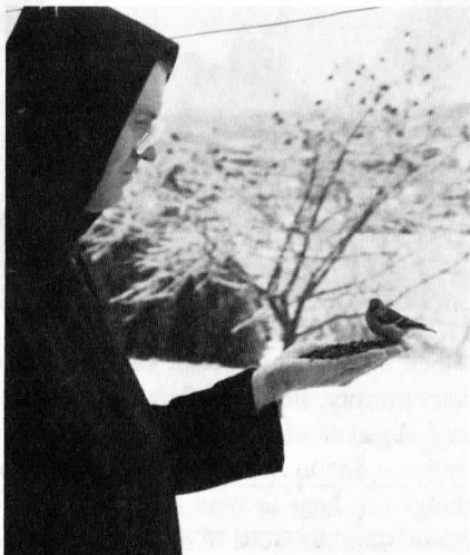
Father Prior likes to feed the little birds.