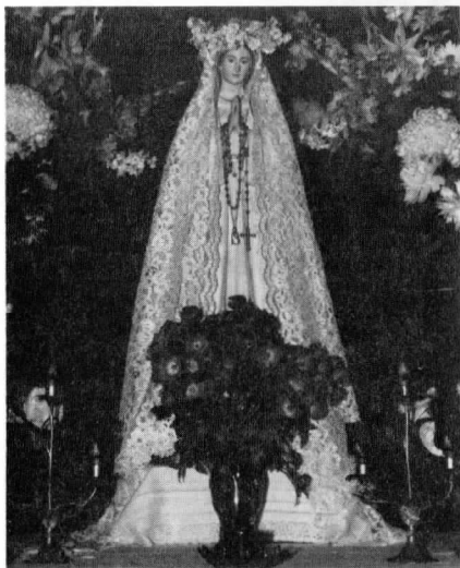
May Crowning was very beautiful this year, and the many flowers certainly were a tribute to Our Blessed Mother.