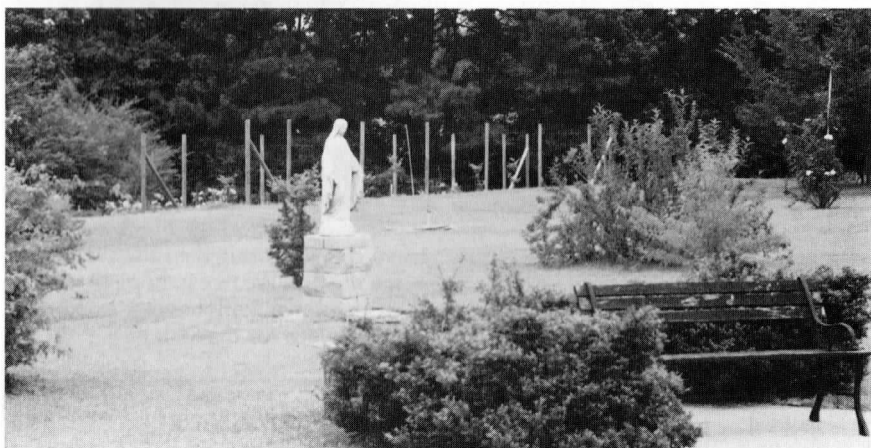
A view of our back yard showing vineyard.

"The whole problem of our time is the problem of love. How are we going to recover the ability to love ourselves and to love one another? The reason why we hate one another and fear one another is that we secretly or openly hate and fear our own selves. And we hate ourselves because the depths of our being are a chaos of frustration and spiritual misery. Lonely and helpless, we cannot be at peace with others because we are not at peace with ourselves, and we cannot be at peace with ourselves because we are not at peace with God."