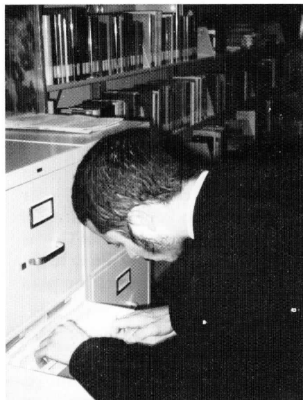
A monk at work

The best sacrifice to offer to God is our EGO (SELF) - our personalities, moods, likes, and dislikes. The best and only gift to offer to Jesus is our hearts emptied of all that caters to self. Our love of God is the best test of duty fulfilled, of our virtue, of our CHARITY. Our love of God is the only scale by which to regulate our judgments and our desires. □