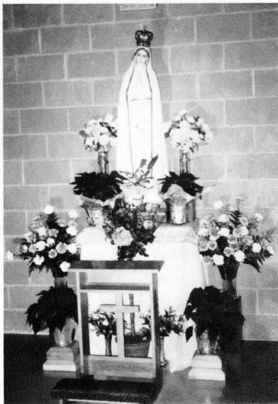
Our Pride and Joy: an authentic (retired) Pilgrim Statue.