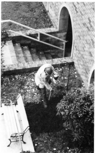
Preparing the little gardens for their long winter's nap.

PLEASE CUT ON THE DOTTED LINE AND RETURN