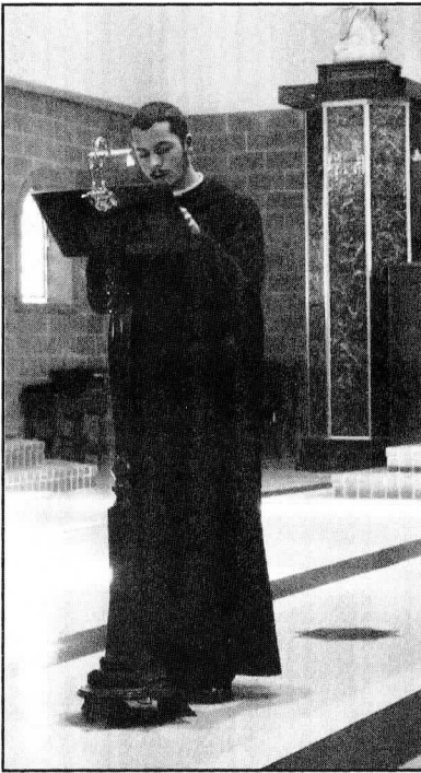
Reading from the Book of Scripture to the Community