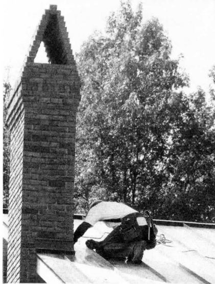
Finishing touches being put on the new sacristy roof of the Abbey Church

Of late, on several occasions, water has found its way into the Church. Nothing serious, thanks be to God, but something had to be done. To replace the old shingles with the same type of shingles would not solve the problem. After much thought and exploration the monks decided to have heavy-duty metal roofs put on each of our buildings. Thanks be to God, most of the roof surfaces were covered with the new roofing when Hurricane Katrina visited us. Some parts were not yet covered and these suffered quite a bit of damage, with shingles blown hither and yon. Fortunately, there was no water damage inside the buildings. The job is now completed and all the roofs are safely covered with the new roofing. Deo Gratias! □