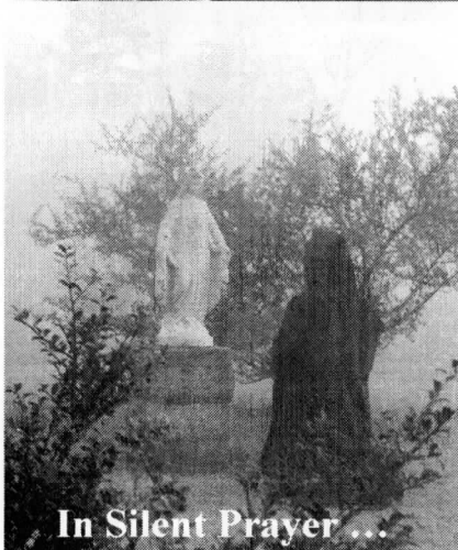
In Silent Prayer ...

Please list here your very special INTENTIONS for which you wish our prayers and good works (confidential information) and return to the Abbey BEFORE JUNE 1, 2006. This paper will be kept on the High Altar next to the Tabernacle for the months of the Sacred Heart and the Precious Blood. The Monks, in their daily prayer and work, will remember you and your dear loved ones - both living and departed.