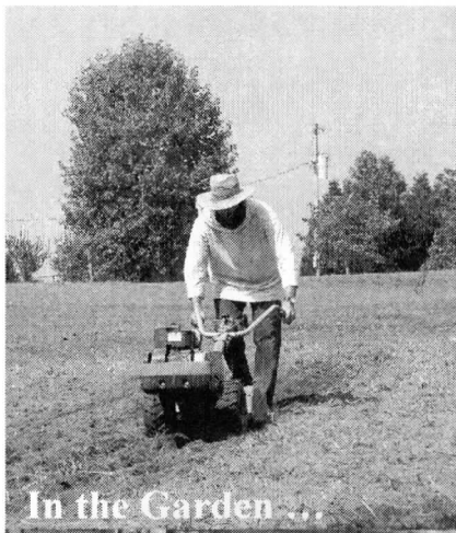
In the Garden ...