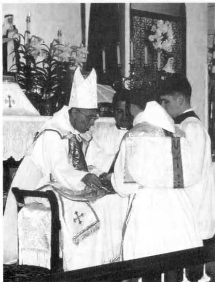
The Calling and the Consecration of Hands