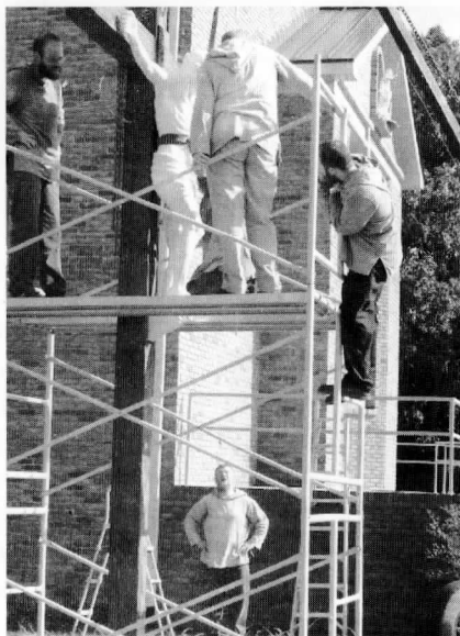
A very difficult and tedious task attaching the corpus to the cross.