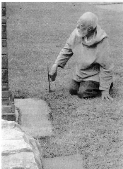
The Abbot continues to interfere and worry.