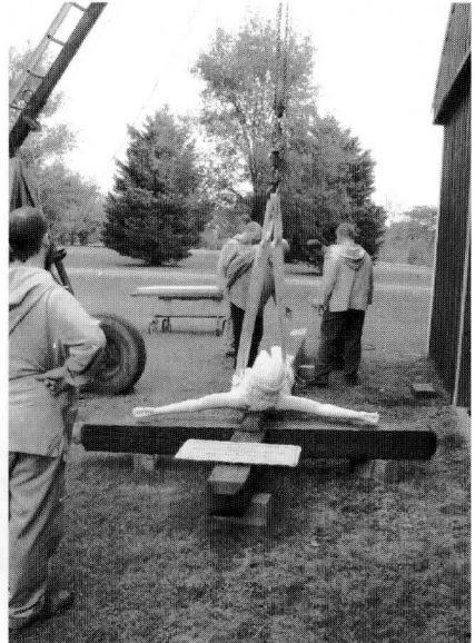
Making final decisions as to how to move the very heavy cross.

The more we move around in our senseless and vicious circles, the harder has it become to achieve and maintain physical sense, mental clarity, and spiritual serenity - all of which are totally essential to wholesome creative thought, righteous standards, and Charity . Is it any wonder, then, that we, generally speaking, have lost contact with the Spirit of God?