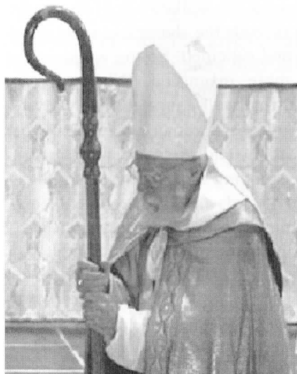
Father Abbot in the Church